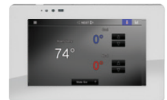
7" Touch Panel

Keep your home perfectly comfortable all day and night. ELAN responds to your preferences, controlling your thermostat, lighting and shades for perfect comfort when you are home, and conserving energy when you're away.