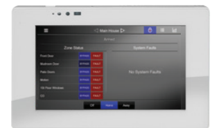
7" Touch Panel

Protect what matters most with more than a locked door. ELAN seamlessly integrates with top security systems for complete peace of mind wherever you go. Check on your home while away? ELAN makes it easy.