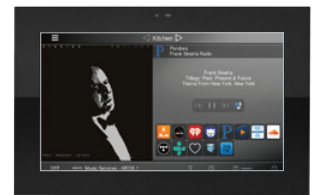
12" Touch Panel

For hands-free smart home control, speak to your ELAN system through our award-winning Amazon Alexa integration.