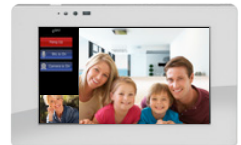
7" Touch Panel

Answer it from the restaurant across town, or the tropical beach across the globe. ELAN Intercom lets you connect with family, wherever you are.